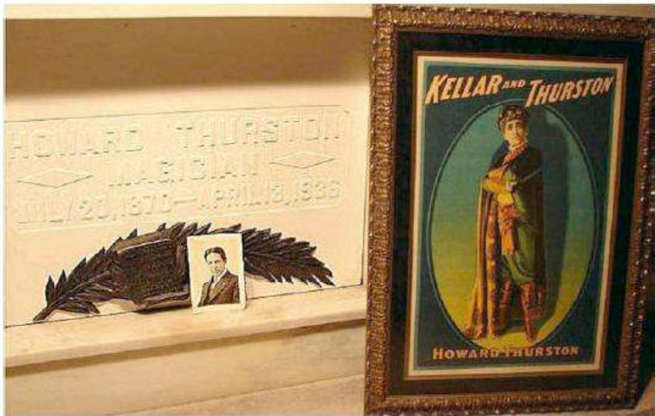
Thurston Tomb at Green Lawn Abbey.